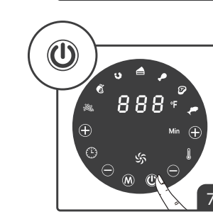
Note: If you want to power off the air fryer in middle of air frying press the power icon

8. Some recipes or ingredients call for shaking the ingredients halfway through the preparation time.To shake the ingredients, pull the pan out of the appliance by the handle and shake it. Then slide the pan back into the air fryer and continue to cook.